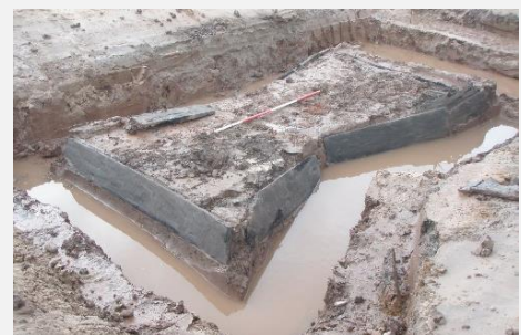
The holding tank at Jersey Way