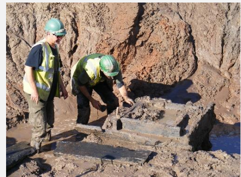
Roman military salt works in Middlewich. Top: Brine shaft, hand dug, and timber lined found just off King Street.