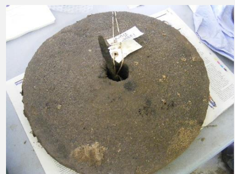
Quern stone found at Jersey Way on top of the back filled brine shaft. Used to grind the salt lumps.