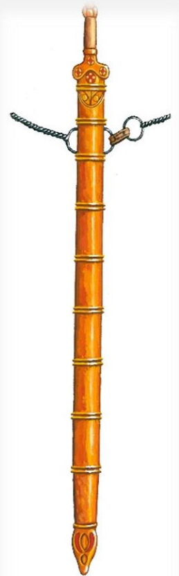
Above left: Gold Coin 50BC – 50AD called a stater . Above centre: A willow lined brine well, the type probably used pre-Roman and beyond. Above right: illustration showing what the sword may have looked like.

Two things gave Middlewich importance: the salt brine-springs and the crossing-points on the Dane and Croco rivers. The brine was exploited around King Street, and this important commodity was traded far a-field.