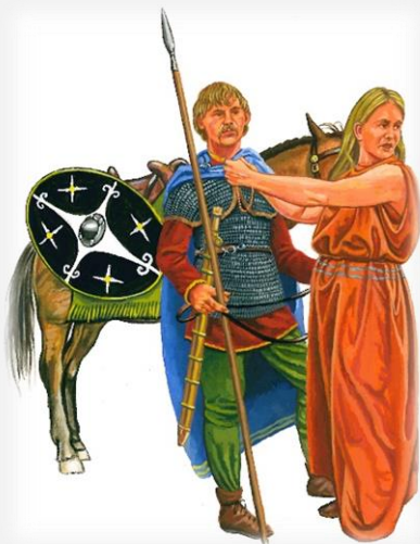
Drawing of the local Cornovii tribe's people

In a general Middlewich's landscape was boggy along most riverbanks; natural crossing-points, such as those near the sites of the bridge in the town-centre and where King Street crosses the Dane, would have been well-used and important.